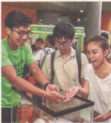
At Temasek Poly's new Centre for Aquaculture and Veterinary Science, you can touch a rodent and pretend that it is cute instead of really gross.

Furthermore, watch out for the fashionistas from the School of Design. The Apparel Design and Merchandising students, easily recognised by their bold and unusual fashion choices, show off their sartorial sense in campus shows, competitions and in the canteens.