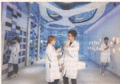
The Perfumery and Cosmetic Science course is unique to SP, where more effort is spent into smelling nice than dressing nice.