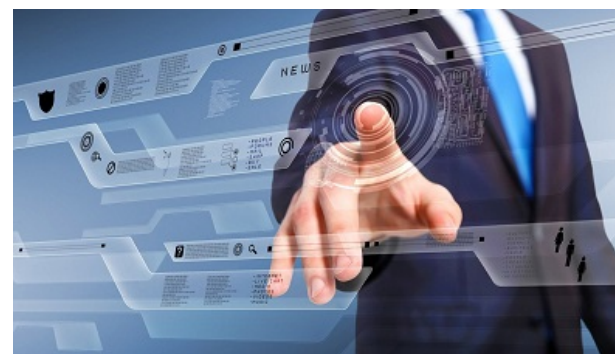
SGUnited Skills Programme

The SGUnited Skills Programme is designed in partnership with the industry to help learners acquire industry-relevant skills which will improve their employability.