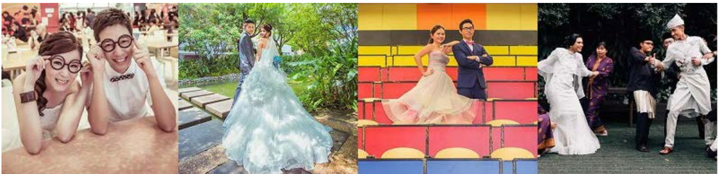
Tan Lay See & Andy Tiong School of Business Class of 2007